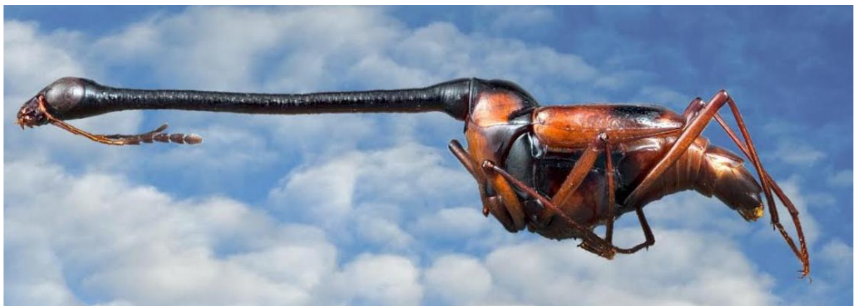
Diatelium wallacei Pascoe, 1866 (More images @ SCAN )